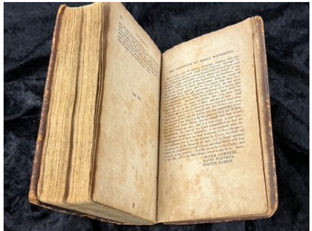
Book of Mormon Census